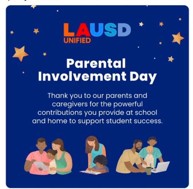
5:11 PM · Nov 17, 2022 · Twitter for iPhone

Celebrate National Parental Involvement Day! We honor our parents and caregivers who make a difference in ensuring that every student receives a quality education.